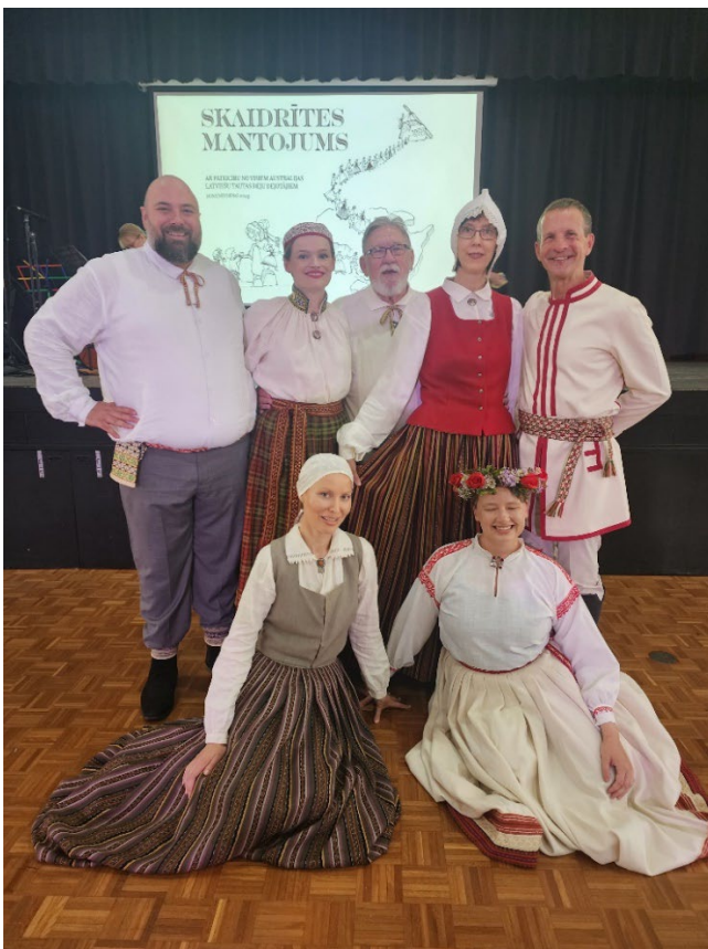
Pērkonītis Sydnejā