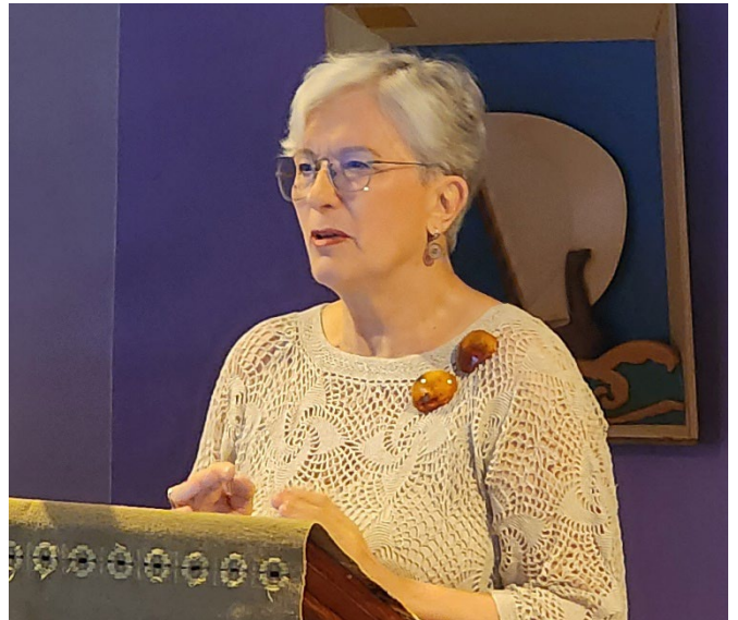
Sandra Kalniete