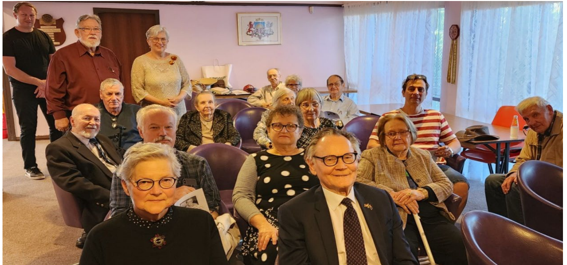
Sandras Kalnietes Svētku runas klausītāji DV klubā, Pertā.

This is Sandra Kalniete's warning to us today: it is all the more necessary for us to stay awake about our regained freedom, because we can also lose it so quickly what, Putin threatens us often. Let us be